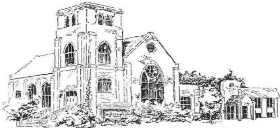
First Congregational UCC - Eagle River, WI