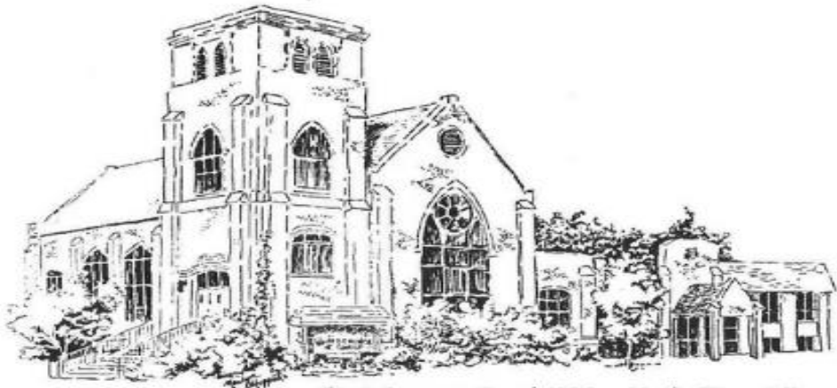
First Congregational UCC - Eagle River, WI