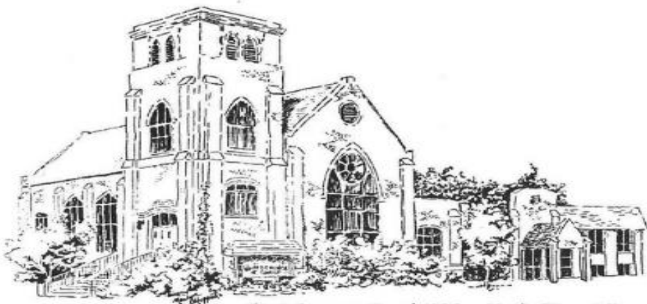
First Congregational UCC - Eagle River, WI