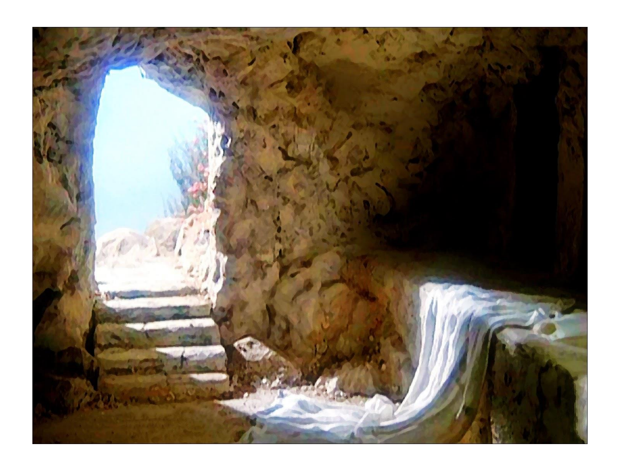
Easter Day Resurrection of the Lord

Empowered by the Holy Spirit and with the help of God, we open our doors and hearts to all, in service and love as modeled by Jesus Christ.