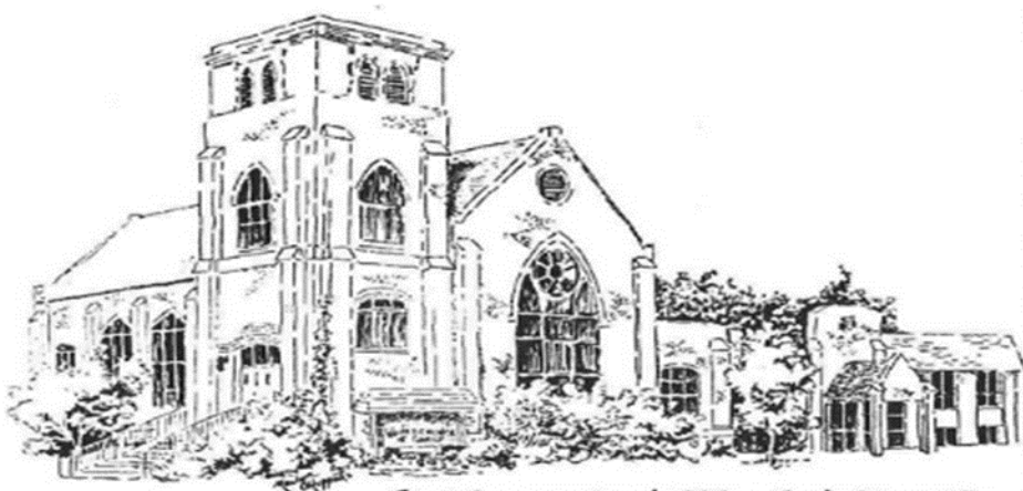
First Congregational UCC - Eagle River, WI