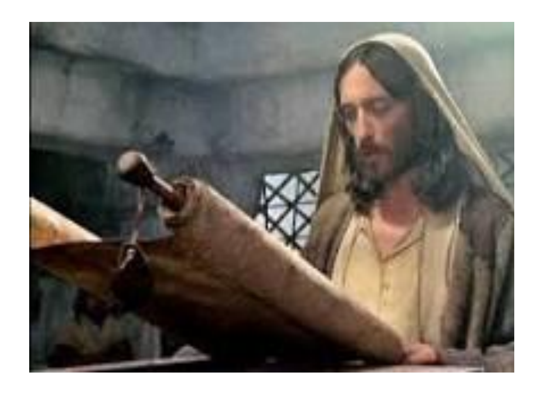
Fourth Sunday after the Epiphany Fourth Sunday in Ordinary Time

Empowered by the Holy Spirit and with the help of God, we open our doors and hearts to all, in service and love as modeled by Jesus Christ.