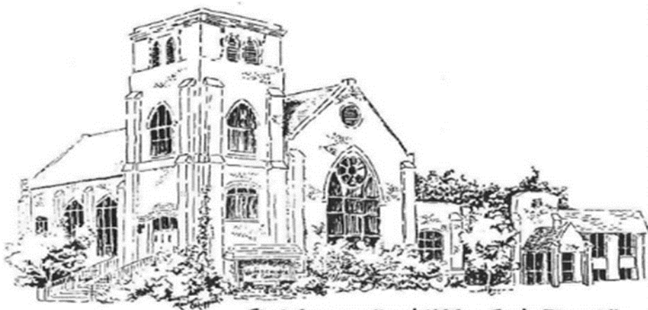
First Congregational UCC - Eagle River, WI