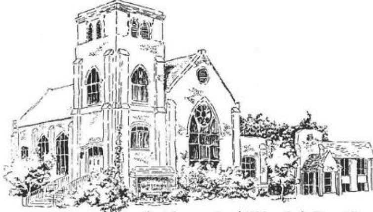
First Congregational UCC - Eagle River, WI