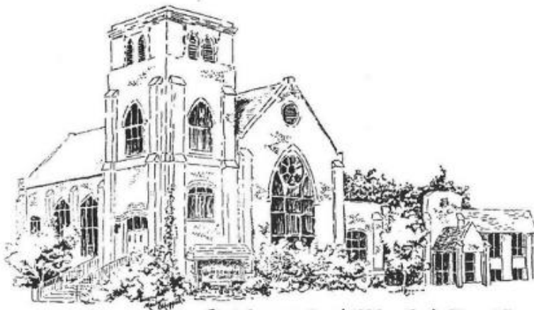
First Congregational UCC - Eagle River, WI