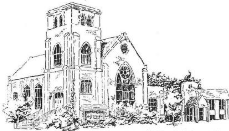
First Congregational UCC - Eagle River, WI