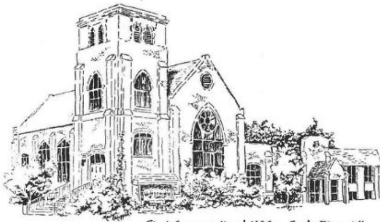
First Congregational UCC - Eagle River, WI