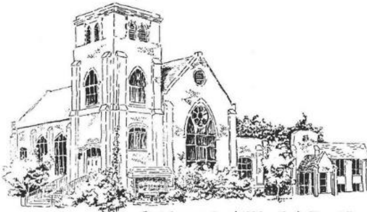
First Congregational UCC - Eagle River, WI