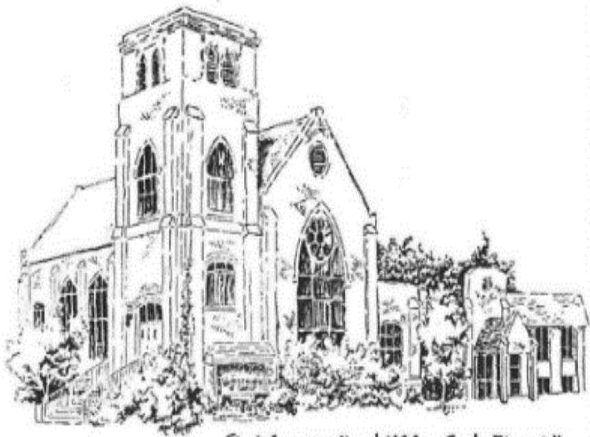
First Congregational UCC - Eagle River, WI