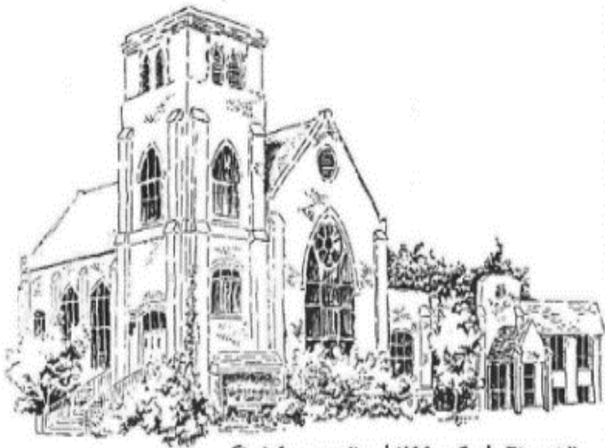
First Congregational UCC - Eagle River, WI