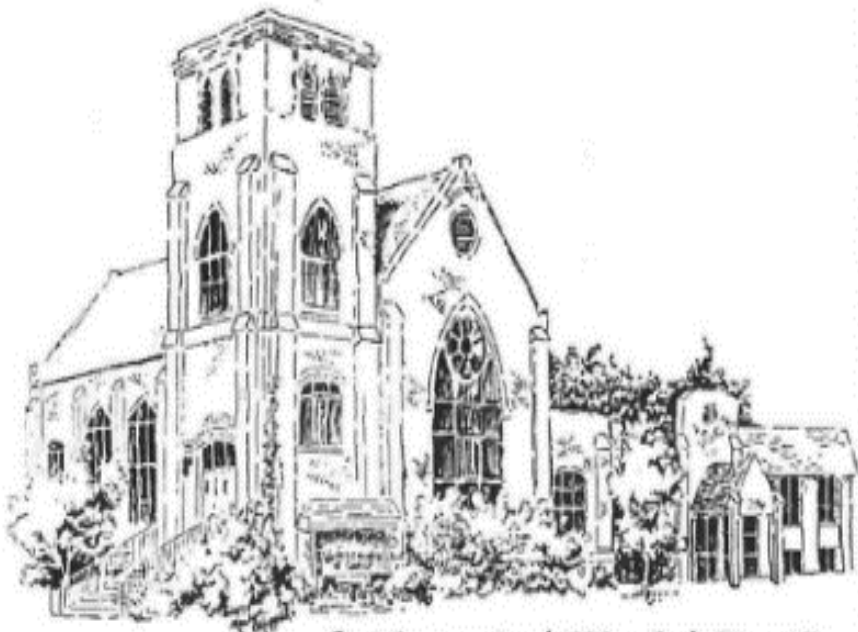
First Congregational UCC - Eagle River, WI