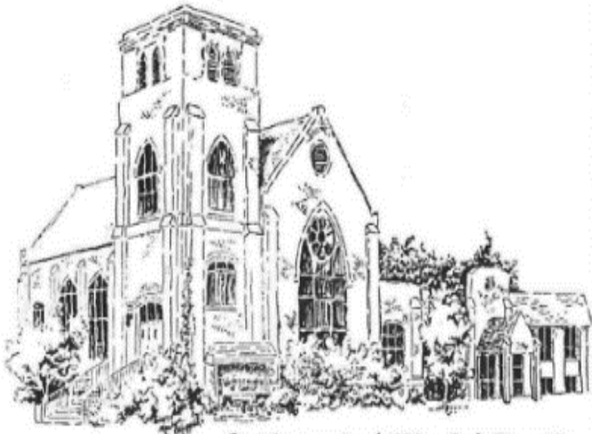
First Congregational UCC - Eagle River, WI