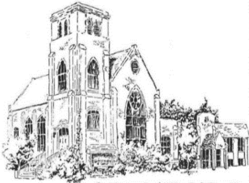
First Congregational UCC - Eagle River, WI