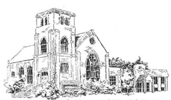
First Congregational UCC - Eagle River, WI